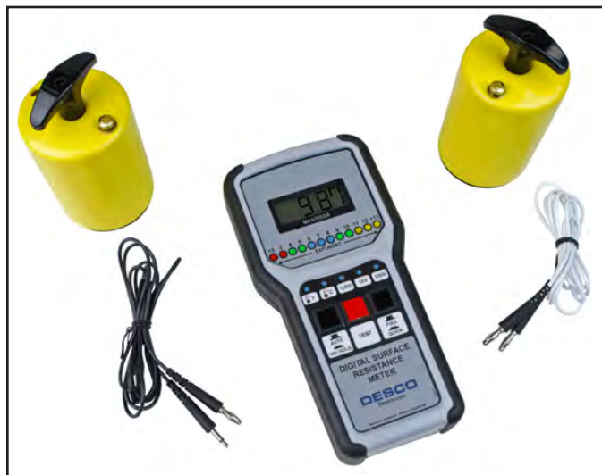
Figure 1. Desco Digital Surface Resistance Meter Kit