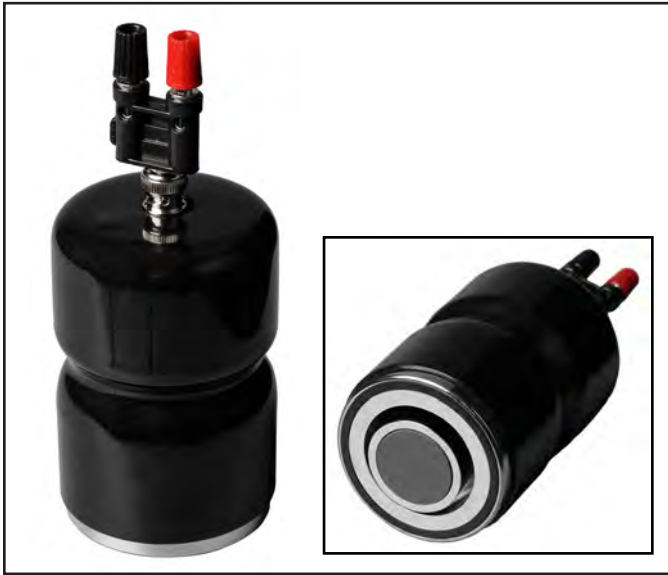
Figure 7. Desco 50005 Concentric Ring Probe

The Desco 50005 Concentric Ring Probe is an instrument to be used in conjunction with a resistance meter, such as the Desco 19787 Digital Surface Resistance Meter, to measure surface resistance per ANSI/ESD STM11.11 the test method listed in Packaging standard ANSI/ESD S541 for surface resistance of planar materials.